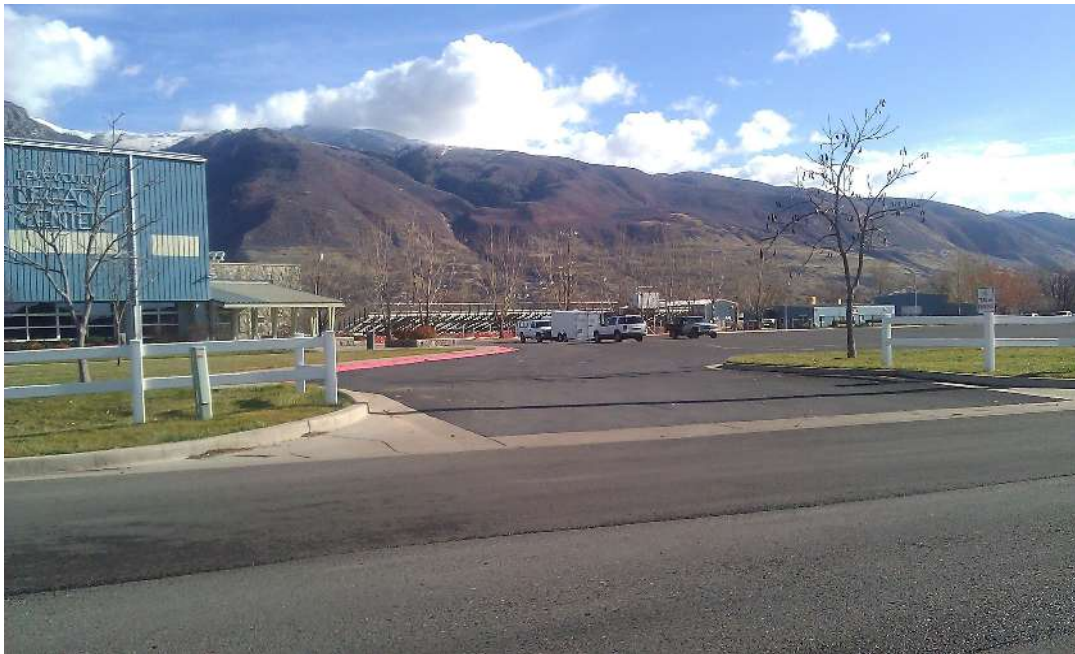
One of the parking lot entrances along 1100 West