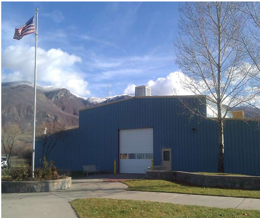
Building #2: The building in which the 2023 VHF Society swap meet will be held. This is the building close to the edge of the parking lot.