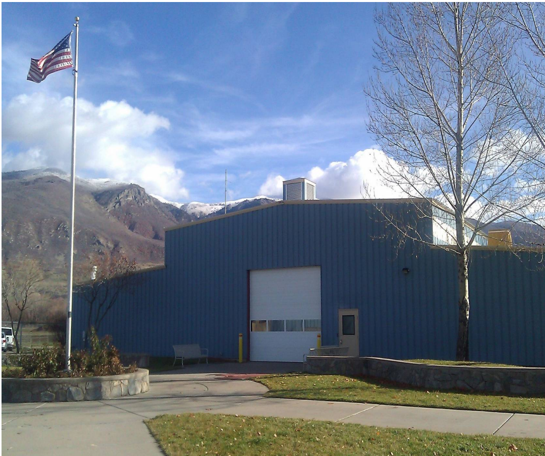
Building #2: The building in which the 2020 VHF Society swap meet will be held. This is the building close to the edge of the parking lot.