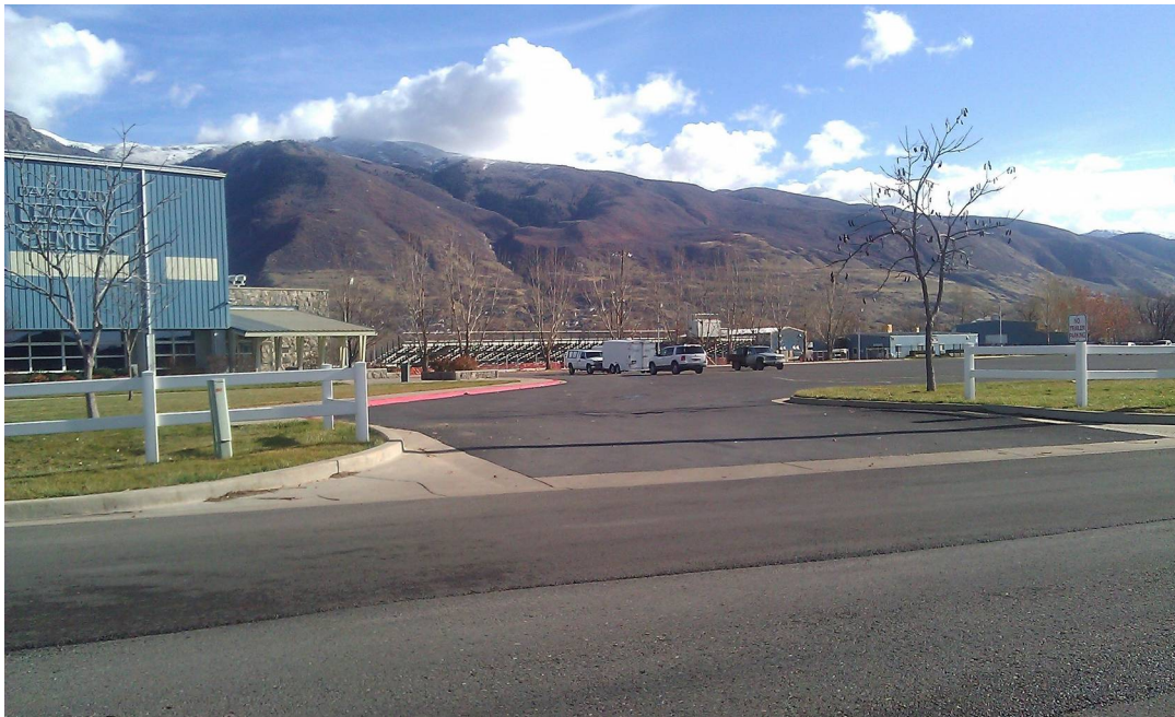
One of the parking lot entrances along 1100 West